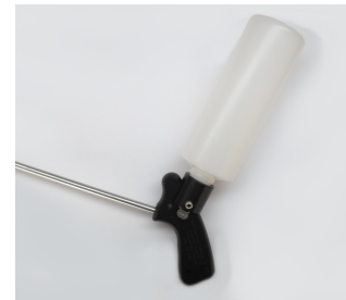
Sleek, lightweight Delrin and durable stainless steel design.

With the Evolution Injector™, embalming has never been easier. Simply remove the cavity injector with the click of a button and screw it onto your solution bottle. Attach the bottle to the Evolution Injector and you're ready to go!