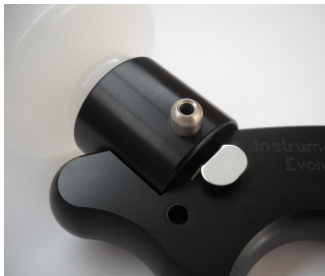
Quick Release bottle attachment for easy bottle installation and removal.

A combination of our chemical cavity injector and Comfort Grip Trocar™ into one new product, bringing you the Evolution Injector™. Designed to bring the process down to one hand for advanced maneuverability.