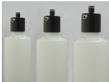
Prepare multiple bottles of fluid for use at one time.