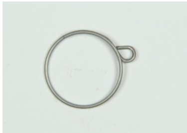
Spring Clip: DVR1200 Fits Both Drivers