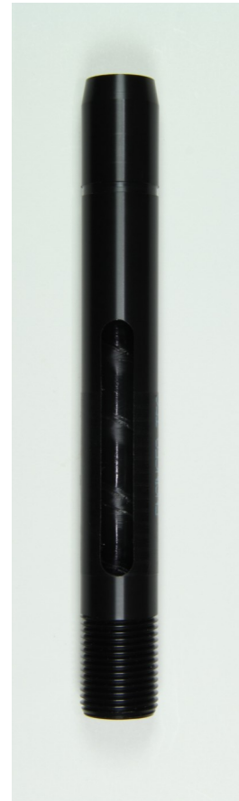
Barrel: DVR2010 For Injector Needle Driver