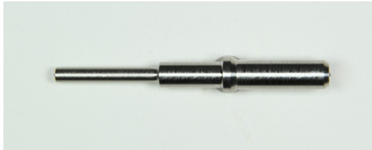
Drive Pin for Drivers: DVR1040 Injector Needle Driver™ DVRCL1030 Classic Injector Needle Driver™

Repair parts are available through your distributor. Should you need assistance determining which replacement parts you need or correct part numbers please feel free to contact us.